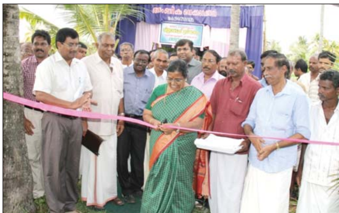
Chairman, MPEDA cuts the ribbon to start the harvest