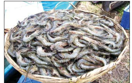
A basket full of organic shrimp

The IOAP had selected 14 farmers covering a Water Spread Area of 30.78 ha from the districts of Alappuzha, Ernakulam and Thrissur in Kerala for the experimental organic