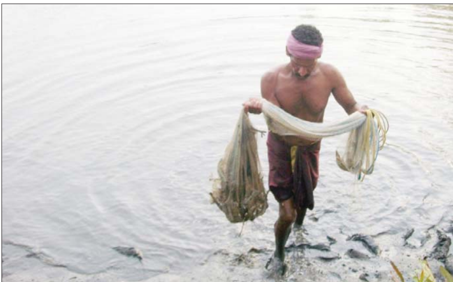
Harvest of organic shrimp: A firm step forward in organic aquaculture production

Further, 92.09 ha in Andhra Pradesh and 133 ha in West Bengal were stocked with the organic shrimp seeds during the season under the organic shrimp farming programme of MPEDA. The farmers are running the farms under the ICS of WAB Trading International, Hong Kong. For the organic shrimp farming project in India, MPEDA has so far empanelled 3 input suppliers for the supply of organic seed and feed viz. M/s. Matsyafed Hatchery, Kollam, Kerala, M/s. Rama Shrimp Hatchery, Kakkinada, Andhra Pradesh (for supply of organic shrimp seed) and M/s. Indo Aqua Technologies, Vishakapatnam, Andhra Pradesh (for supply of organic shrimp feed), with a validity of the empanelment for 3 years.