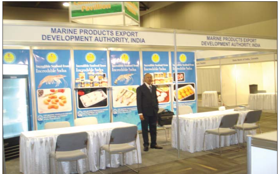
A view of the MPEDA Stall

There were over 45 exhibitors from India showcasing their products i.e agriculture, apparels, carpets, marine products and other items. APEDA had taken a larger area for displaying their products as well as the products from their registered members. Apart from MPEDA, the commodity boards - Spices, Tea, and Coffee also participated in the expo and showcased their products in their respective stalls. Members of Apparel Export Promotion Council (AEPC), Carpet Export Promotion Council (CEPC),