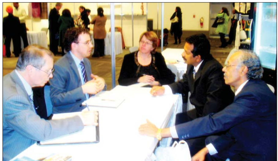
Visitors in discussion with MPEDA Officials

The visitors were fascinated by the seafood samples displayed in MPEDA stall. The Show had over 1000 visitors according to the organizers. Most of them belonged to the ethnic Indian community of Canada.