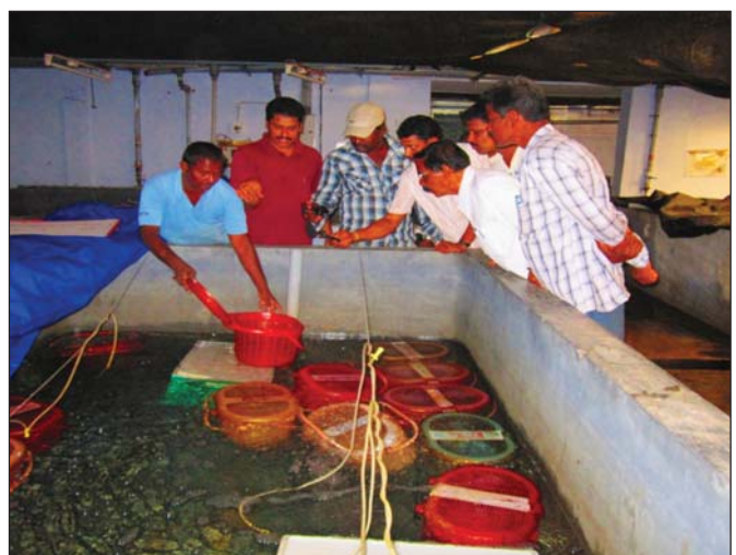
Karnataka farmers at Scampi project of RGCA, Kankipadu (AP)