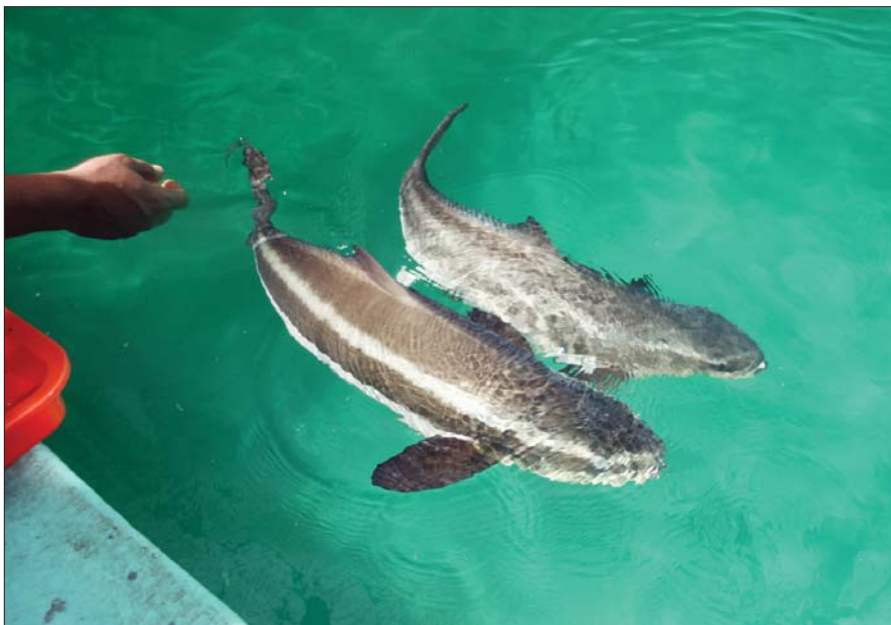
Cobia broodstock in RAS tank

AFTM has plans to use the seed material from India for a finfish stock enhancement programme after larval rearing. The logistics to reach out to the AFTM facility located in a remote suburb posed a challenge for RGCA. The seed was first transported via Dubai to Teheran. After an overnight stay there, it was taken to the hatchery site by a local flight next day morning. It has had trade enquiries from Taiwan, Philippines and other South East Asian countries also.