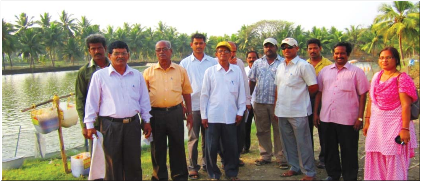
Members of the team during field visit

explained by the MPEDA Officials. Sample collection method under NRCP and the processing of the samples to get the residue were explained and various doubts on antibiotic issues were clarified by the MPEDA officials.