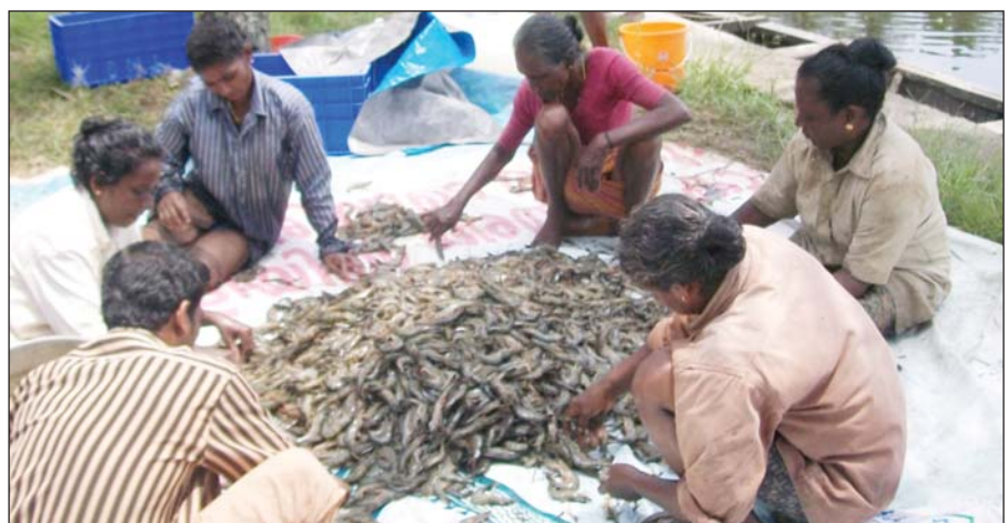
Sorting the harvested organic shrimp

incidence of recurring disease and repeated crop loss. At the instance of MPEDA, the farmer stocked his farm on a trial basis. The organic shrimp seeds for stocking were procured from M/s. Matsyafed Prawn Hatchery at Kollam. The PL – 10 samples were tested in RGCA laboratory and reported negative for WSSV. The packing, transportation, acclimatization and stocking of seeds were done under the monitoring of the IOAP team of MPEDA. The