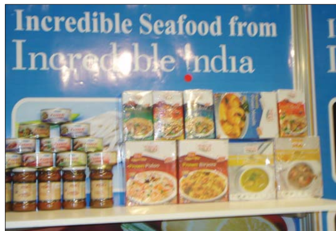
Display of value added retail packs