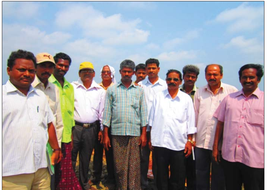
Members of the study team during field visit.

Aquaculture in Karnataka is carried out only in three coastal districts, viz., Uttar Kannada, Udupi and Dakshin Kannada. The species under culture are mainly Penaes monodon and Litopenaeus vannamei . During March 2012, the Sub Regional Centre of MPEDA in Karwar organized an Interstate Study Tour to Bhimavaram in Andhra Pradesh to provide acquaintance to the farmers on the farming activities in the neighbouring state and to interact with their counterparts there. The touring team was extended all support by MPEDA Sub Regional Centre (Aqua), Bhimavaram and Rajiv Gandhi Centre for Aquaculture (RGCA), Vijayawada. The farmers could get themselves exposed to various aspects of scientific farming practices followed in Andhra Pradesh and could interact with other farmers, officials and feed mill owners of Andhra Pradesh.