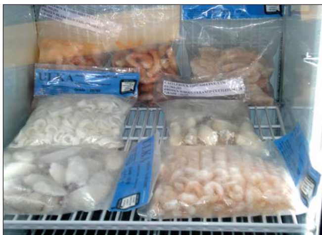
Display of frozen value added products