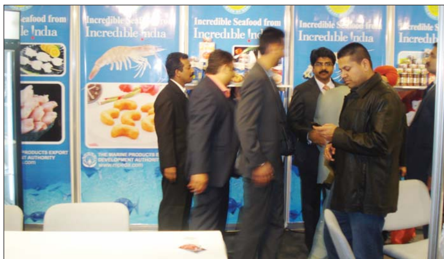
Visitors in MPEDA Stall