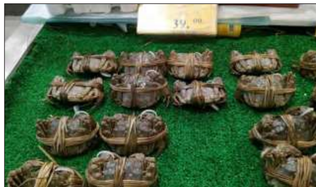
Live Crab with Retail Price