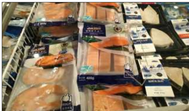
Atlantic salmon portion and Crispy Seaweed Shrimps