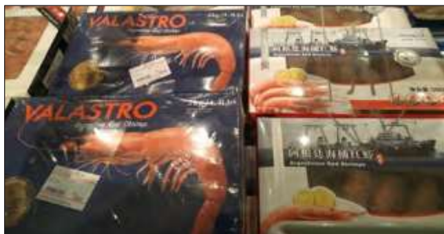
Frozen Argentine Red Shrimp on Retail pack

and dried in Eon super market. It will be beneficial for Indian exporters, if they are able to market the seafood directly to the Chinese supermarket chains like Carrefour, Jusco, Metro and Wal-Mart. This will help to avoid the middlemen and traders in the sector for better realization of value for Indian seafood in China.