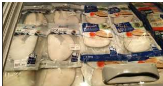
Frozen Patagonian Toothfish Steaks in Retail pack