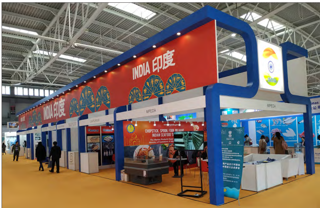
Front view of the MPEDA pavilion

T he 24 th Annual China Fisheries and Seafood Expo (CFSE) was held at Qingdao International Expo Center, Qingdao City, China, from October 30 to November 1, 2019. The event featured almost 1,600 business exhibiting companies from 53 countries and Region, including 22 overseas national and regional pavilions.