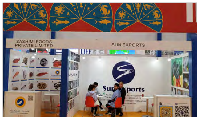
Stalls of Indian seafood companies at CFSE 2019