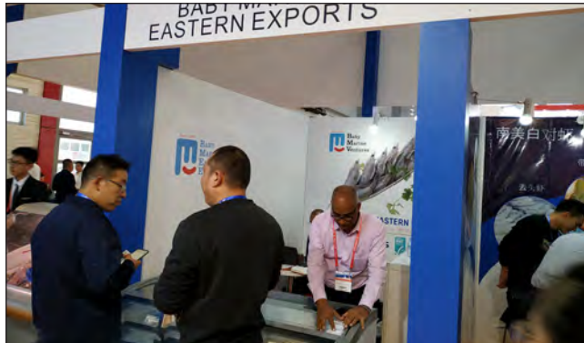
Stalls of Indian seafood companies at CFSE 2019