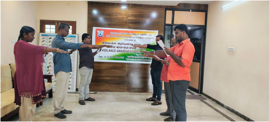
Integrity Pledge administered by the MPEDA Sub-Regional Division, Tuticorin, on 27th October 2025.