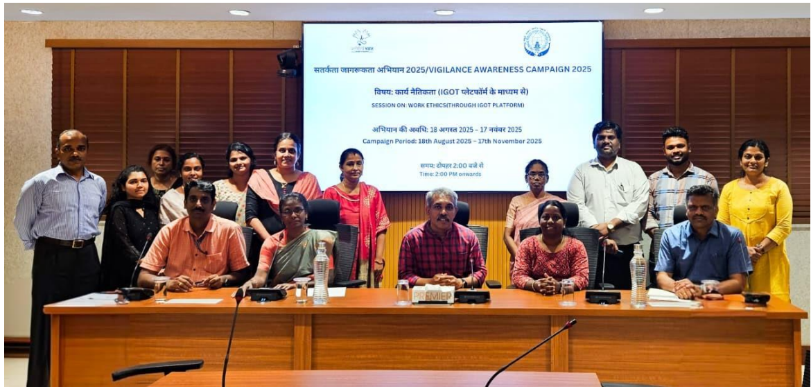
Participants of the Work Ethics session held on 23rd September 2025 along with the Secretary, MPEDA, and the Deputy Director (Vigilance), at MPEDA Head Office, Kochi.