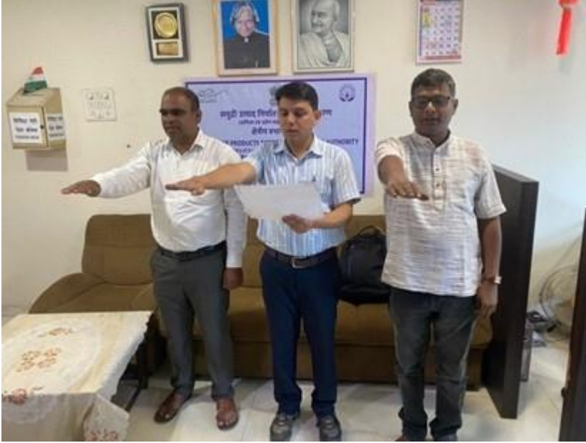
Integrity Pledge administered by the MPEDA Regional Division, Mumbai , on 27th October 2025.