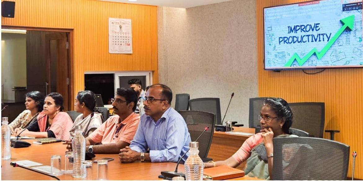
Officials attending the session on Work Ethics held on 23rd September 2025 at the MPEDA Head Office, Kochi.